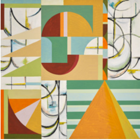
The Conception of Parallel Event No.14, 2023

As for whether the artist is painting or writing, and whether the viewers are observing or reading, all become entirely open and free. There's no need to define the artwork; what remains is the pure sensory experience of human eyes perceiving forms, colors, and brushstrokes in multi-dimensions, corresponding to the unique inner states of individuals and broader contemporary themes.