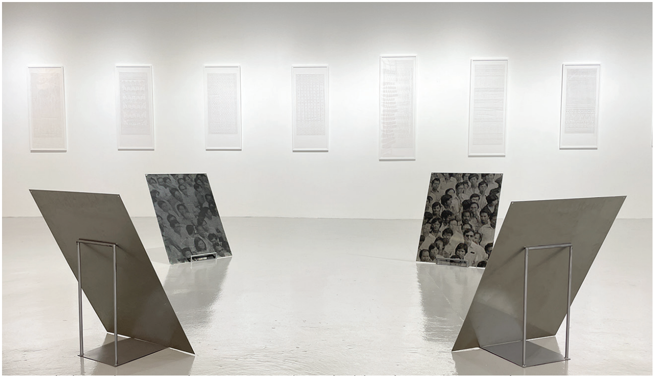
Foreground: Chung Erica, For Decades , 2019, Screenprint on aluminium plates, 60 x 80 cm each. Background: Supassara Ho, ( Series: '8: Hand Writing Series ), 2024, Graphite drawing on tracing paper

installation sees her grappling with the topic of privacy, both on the internet and in real life; Lim will be performatively covering the walls of the gallery in printouts at the opening of the exhibition. Celine Mercado , who hails from the Philippines, wraps found furniture in fibre threads as part of a body of work intended to convey conditions of liminality and precarity, especially among the Filipino diaspora. Chung Erica , also Singaporean, uses the medium of print to tell the story of citizenship and civic participation, while Supassara Ho , from Thailand, has utilized the methods of needle-based craft, such as crocheting, to address biographical issues. In mid-December, London-based, Singapore-born artist Lynn Lu will activate the exhibition with a performative piece.