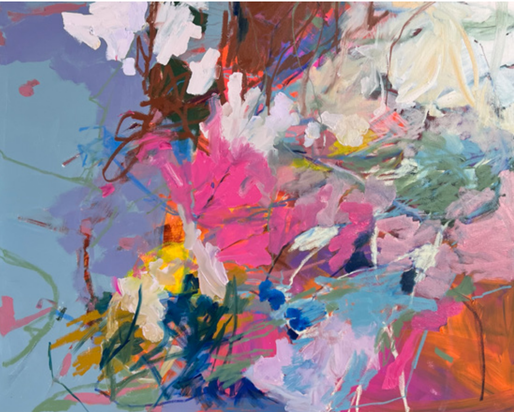
BeChanida, Painting 4, 2023, acrylic and oil on canvas, 150 x 120 cm