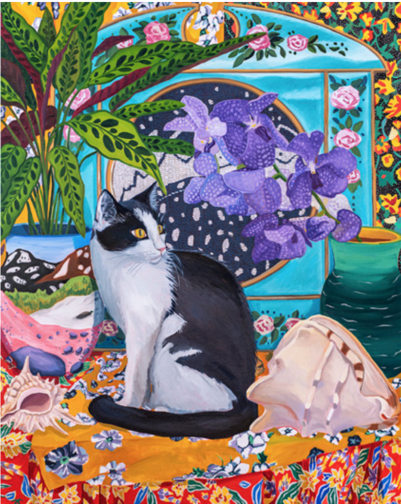
Anna Valdez, Ollie's Shrine , 2023, oil on canvas, 152.4 x 121.9 cm