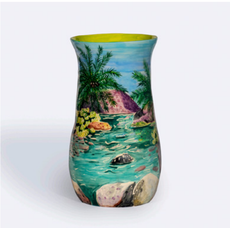
Anna Valdez, Pond Landscape , 2023, ceramic, 44.5 x 27.9 cm