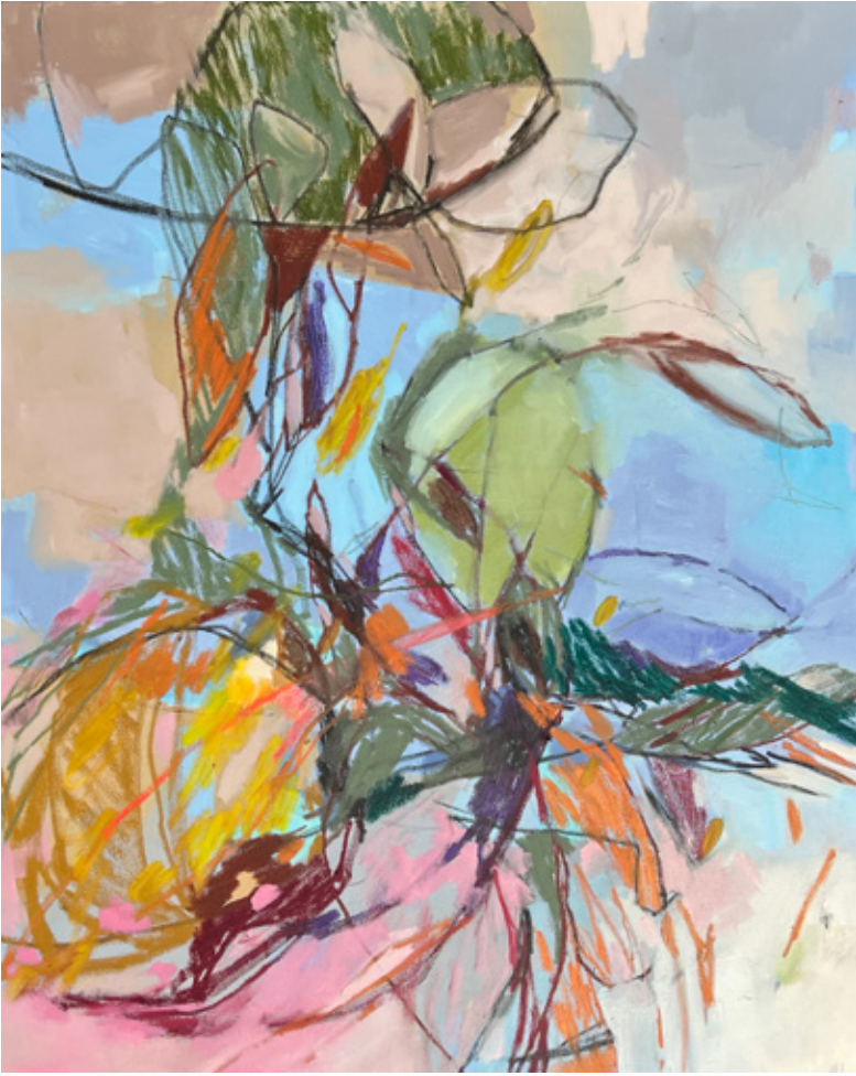
BeChanida, Painting 15, 2023, acrylic and oil on canvas, 120 x 150 cm