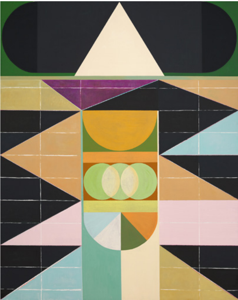
Liang Manqi, The Shape of Light , 2018, oil on canvas, 200 x 160 cm