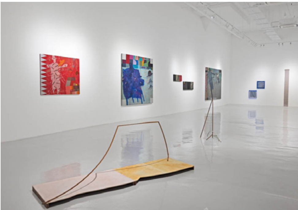
Installation view of Thinking About Abstraction, Part I