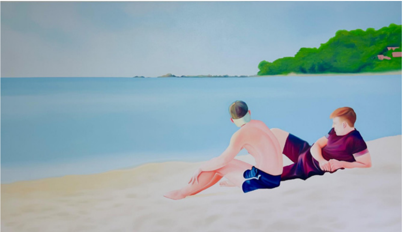
Özer Toraman, Untitled , 2023, oil on canvas, 130 x 225 cm