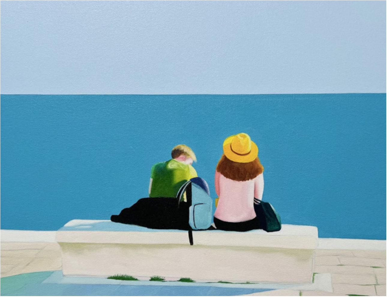
Özer Toraman, Whispering Sentiments 4 , 2022, oil on canvas, 35 x 45 cm