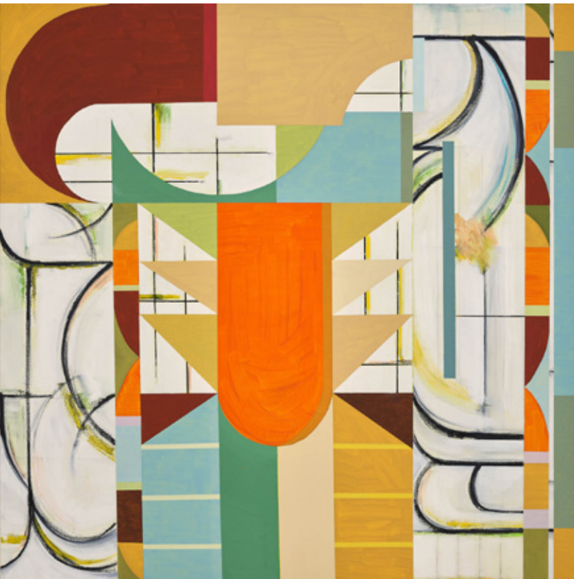
Liang Manqi, The Conception of Parallel Event No.15 , 2023, 120 x 120 cm